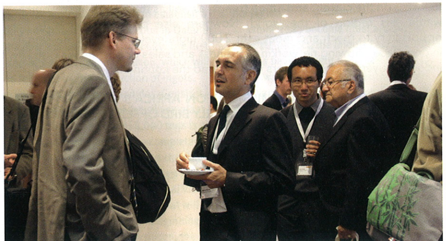
The participants of the SHC 2013 had enough time between lectures to discuss the results of research projects.